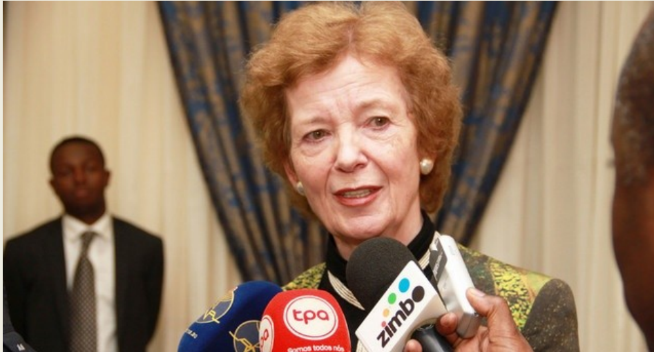
MARY ROBINSON, Special Envoy of the Secretary-General of the United Nations

The Special Envoy of the General Secretary of the United Nations for the Great Lakes Region, Mary Robinson paid an official visit to Angola on May 7, 2014, to analyze with the Angolan authorities the situation in the Great Lakes Region.