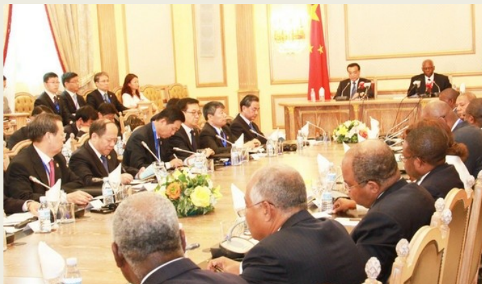
Bilateral meeting between Angolan and Chinese authorities in the presence of the Chinese Premier and the Angolan President

During his stay in Luanda the Chinese Prime Minister has participated at the official bilateral meetings between the Angolan and Chinese delegations, which has enabled the governments, enterprises and financial institutions to sign a series of economic and commercial agreements, in particular an agreement on the suppression of visas in the diplomatic and official government passports.