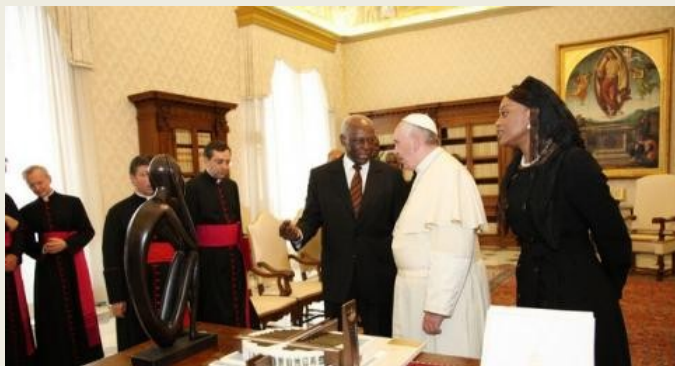
The Angolan President and His Holiness exchange gifts