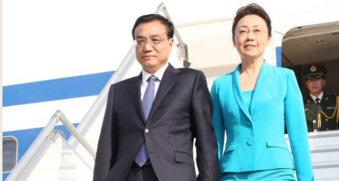
The Chinese Premier arrives at the airport in Luanda