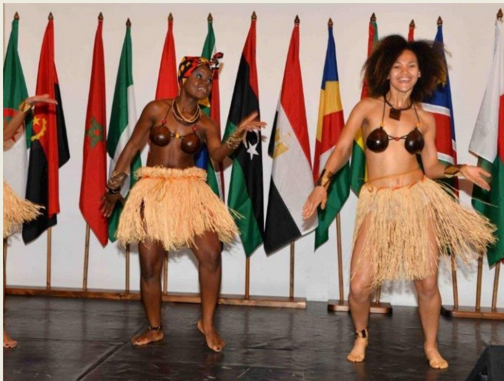
A show of African dance

This colourful event truly confirms the highly interesting potential of the African Continent.