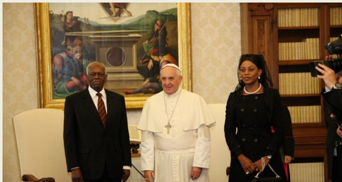
Pope Francis receives the Angolan president and his wife

Friday, May 2, 2014, President José Eduardo dos Santos was received in the Saint Peter Basilica by His Holiness, Pope Francis, with whom he discussed the cooperation between Angola and the Holy See.