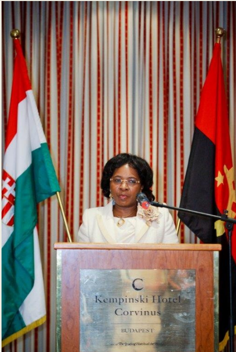
H.E. the Ambassador of Angola in Hungary