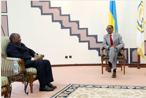
Georges Chicoti received in audience by Rwandan President Paul Kagame