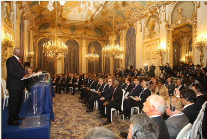
Speech of the Angolan President at the Economic Forum at the Quai d'Orsay

Certain diplomatic sources affirm « it's about a historic visit during which Paris and Luanda have renewed and relaunched their relations at highest level ». It was nearly two decades ago that an Angolan President has effectuated an official visit in France.